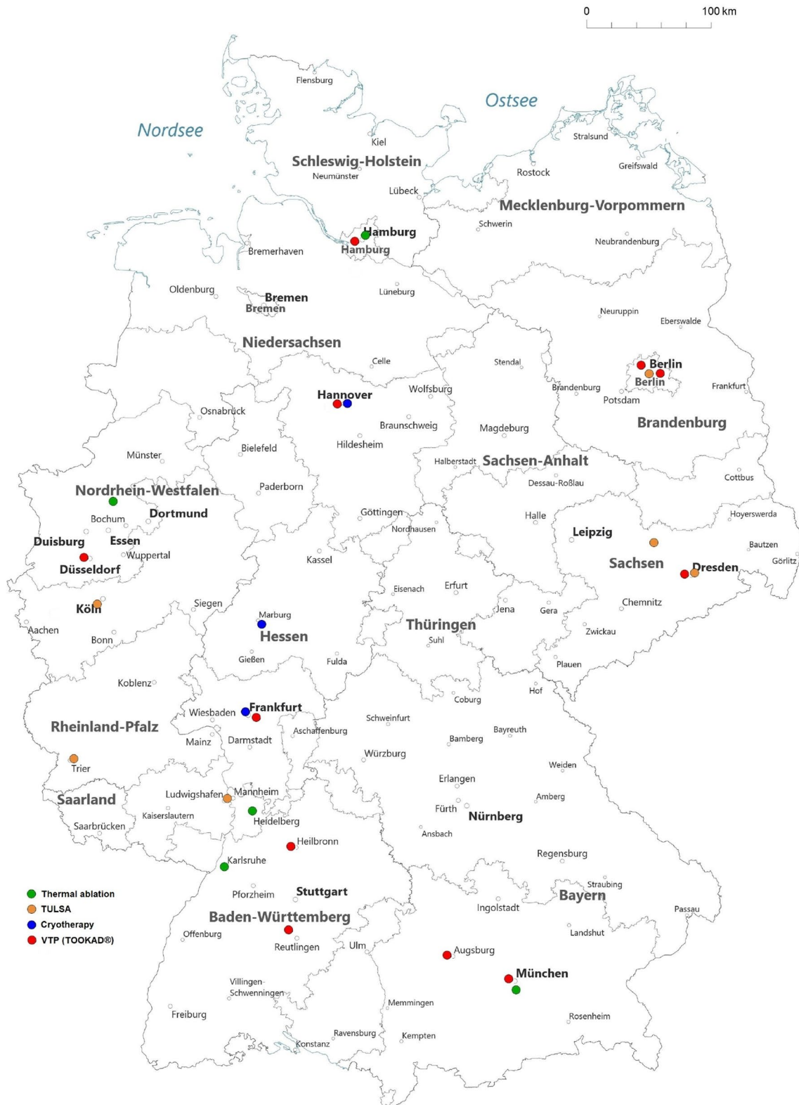
Fig. 3 Overview of urologic departments offering thermal ablation, TULSA, cryotherapy and VTP TOOKAD® for PCa treatment in Germany in 2019